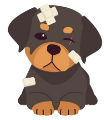
Other Eye Injure, Inability to Pass Stool, Blood in Stool

You should always seek veterinary help if you suspect a pet emergency. Make sure you have your veterinarian and closest emergency service's information easily accessible.