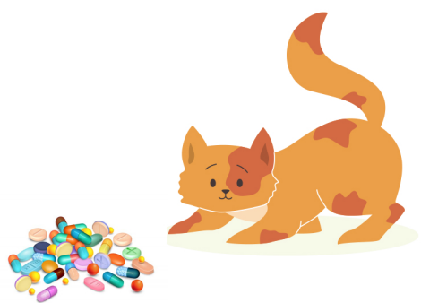
Poison Chemicals, Foods, Allergic Reactions