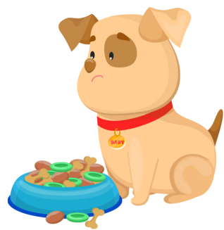
Throat Choking, Severe Vomiting, Refusal to Drink/Eat