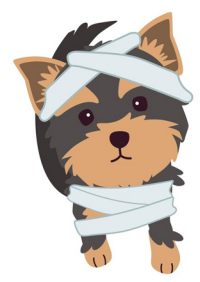
Trauma Bites, Bleeding, Impacts